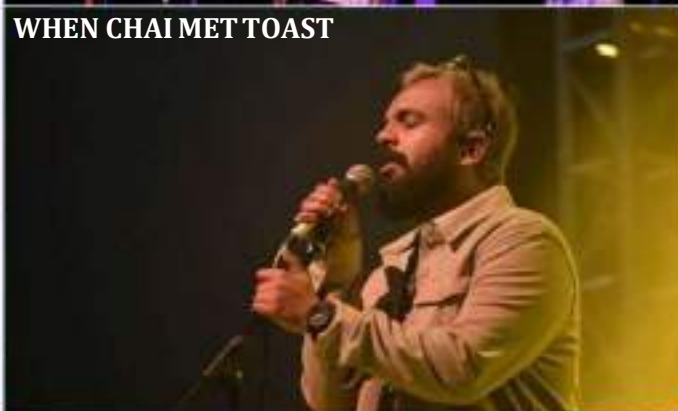
WHEN CHAI MET TOAST